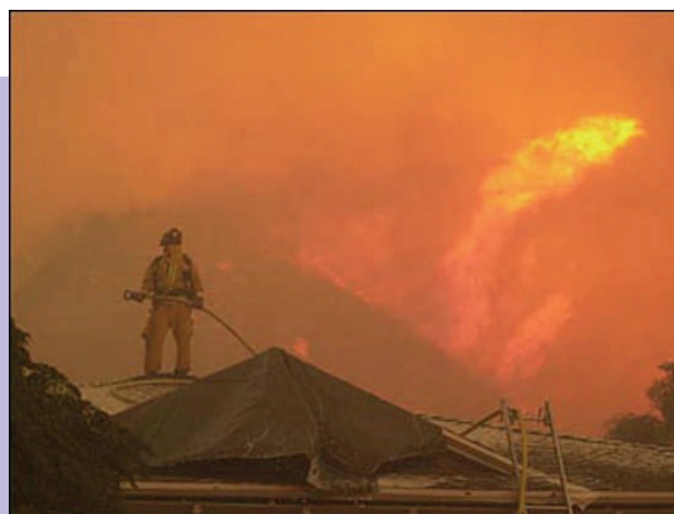
Climate change could result in an extended fire season.