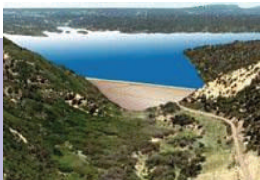
Artist’s rendition of completion of Ridges Basin Dam, being built pursuant to implementation of the Colorado Ute Settlement Act of 2000.

It has long been the accepted premise that meeting the cost of Indian water and infrastructure in Indian water rights settlements is the trust responsibility of the federal government. At the same time, it must be acknowledged that an appropriate share of these costs of settlement, which correspond to non-Indian water and infrastructure benefits, increasingly a component of Indian water rights settlements, should be borne by the states. The states and the federal government must work together to jointly design and fund settlement projects that provide the greatest benefit for Indian and non-Indian water users alike in those situa-