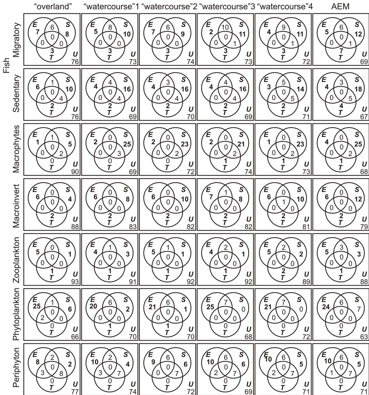
Figure 2. Results from partial redundancy analysis. Shown are the relative contributions (% of explanation) of environmental (E), spatial (S), and temporal (T) variables, as well as the shared components explaining variation in abundance of aquatic metacommunities (except for aquatic macrophytes, in which only presence/absence is available), using overland and four watercourse distances to generate spatial predictors. U = unexplained component. Zeros indicate values lower than 0.5%. The significance of the pure components (E, S and T) was tested using random permutations; bold numbers indicate significant values. Macroinvert = Benthic Macroinvertebrates. doi:10.1371/journal.pone.0111227.g002

between the relative roles of processes driving metacommunity structure and dispersal ability inferred by body size. Other studies with similar goals (e.g., [32]) were not able to formally test this relationship due to the lower number of organism groups that differ in dispersal abilities that could be compared. To test for generality of this pattern, we encourage further studies to test this relationship using data on multiple biological groups that differ in dispersal abilities surveyed in the same set of sampling sites.