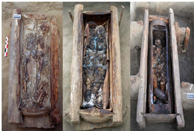
Figure 2. Graves of three frozen bodies from Yakutia. Bodies were autopsied and diagnosed as having bone tuberculosis: Graves of Okhtoubout 2, Kyys Ounhouogha and Bakhtakh 3 respectively. doi:10.1371/journal.pone.0089877.g002

The palaeoepidemiological study was undertaken after grouping the TB and non-TB subjects into time periods [33]. Prevalence was calculated as the number of individuals presenting the disease divided by the number of individuals in the study population. Crude Prevalence Rate (CPR) was calculated for each time period sub-unit: the number of individuals with the disease was divided by the number of individuals in each period sub-unit. The