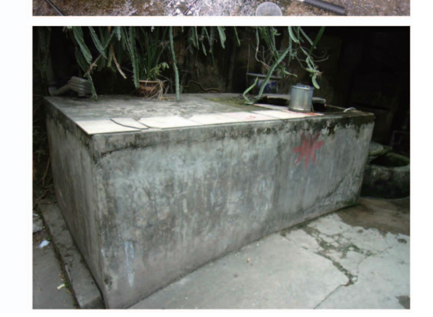
Figure 1. Typical water tanks in Hanoi. A) Roof-top metal tank. B) Underground concrete tank. C) Above-ground concrete tank. doi:10.1371/journal.pone.0095606.g001

were significantly different. The mean outside air temperature was lowest in January 2011 and 2012, though it was not significantly different from means of the room temperature and metal tank water temperature (Table 2). Concrete tanks were warmer in January 2011 and 2012 compared to outside and room temperatures.