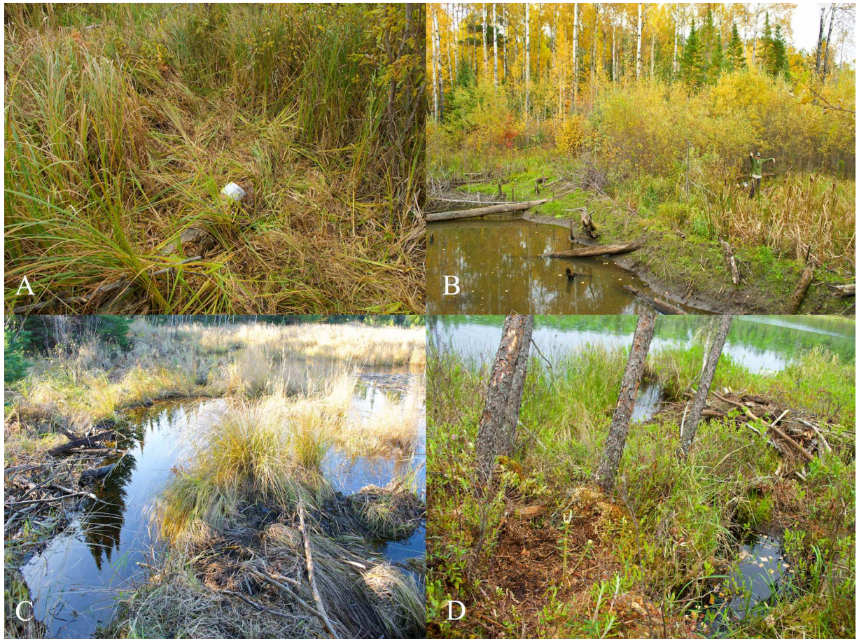
Fig 2. Examples of evidence found at beaver kill sites (A,B,C), and of wolf behavior when in active beaver habitats (D) in Voyageurs National Park 2015. A) Matted vegetation at kill sites provided important information about how wolves killed beavers. B) Co-author Homkes stands at Beaver Kill Site 13 <10 m below an active beaver dam. C) Beaver Kill Site 18 on a small point <5 m from the active dam where a wolf, based on the trampled vegetation, presumably pulled a kit beaver out of the water and consumed it. D) A wolf bed (lower left corner) found when examining clusters of GPS-locations in the spring. The wolf bedded for \geq 4 hr next to this active beaver lodge without making a kill.