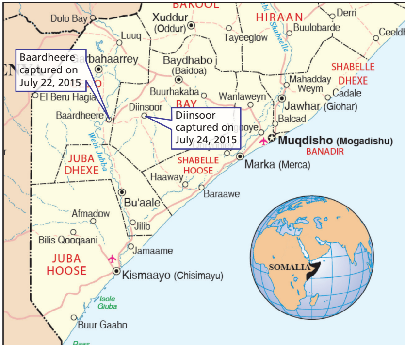
Figure 3.2 Operation Jubba Corridor, July 2015

ing Mission, for example, provided training and assistance to Somali government forces and security institutions. 29 U.S. assistance involved three broad components: training, advising, assisting, and occasionally accompanying AMISOM and Somali forces; conducting targeted strikes; and helping coordinate activities with AMISOM leaders.