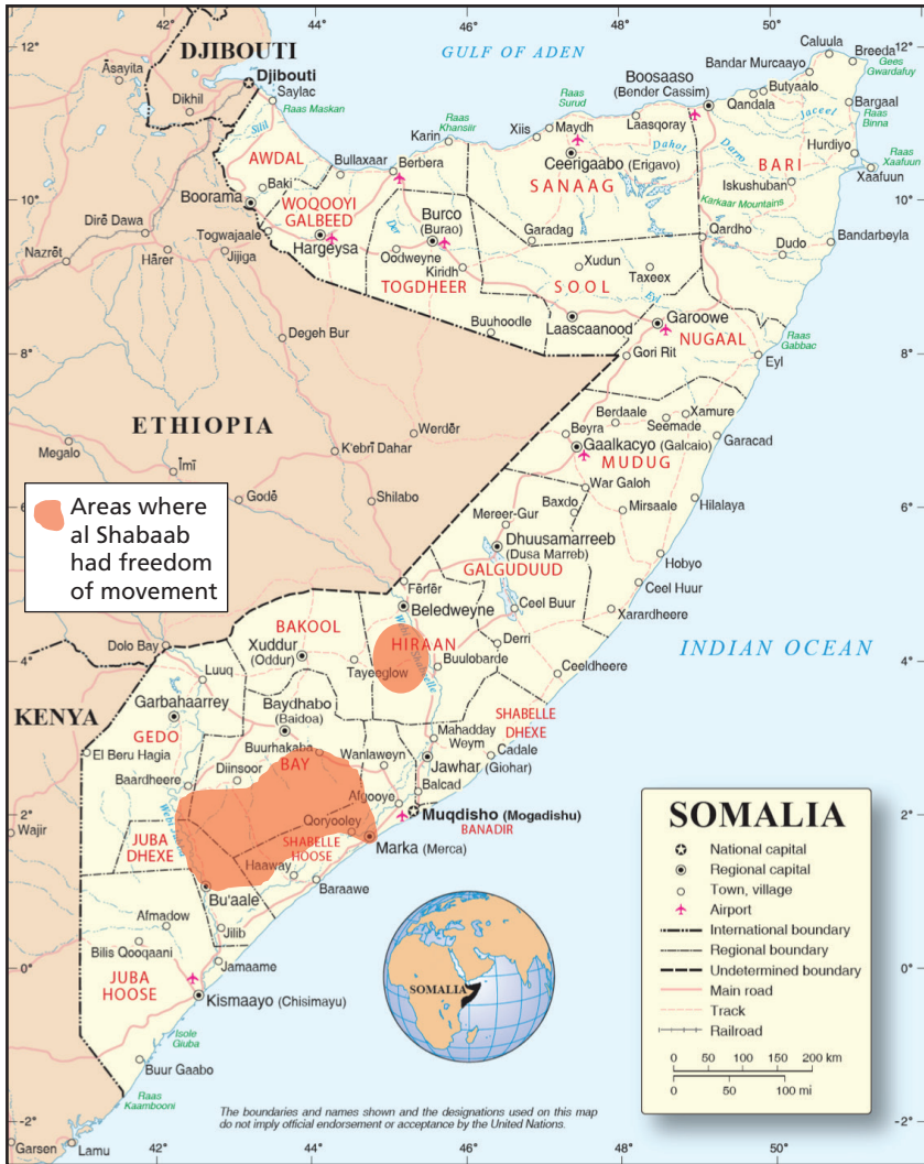
Figure 2.4 Al Shabaab Freedom of Movement, Late 2016

NOTE: Data are from AMISOM; the START database; Jane’s World Insurgency and Terrorism database; and author estimates.