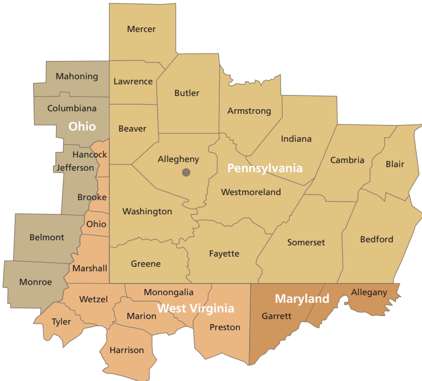
Figure 1.1 The 32 Counties That Make Up the Southwestern Pennsylvania Region