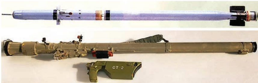
Figure 3.3 SA-18