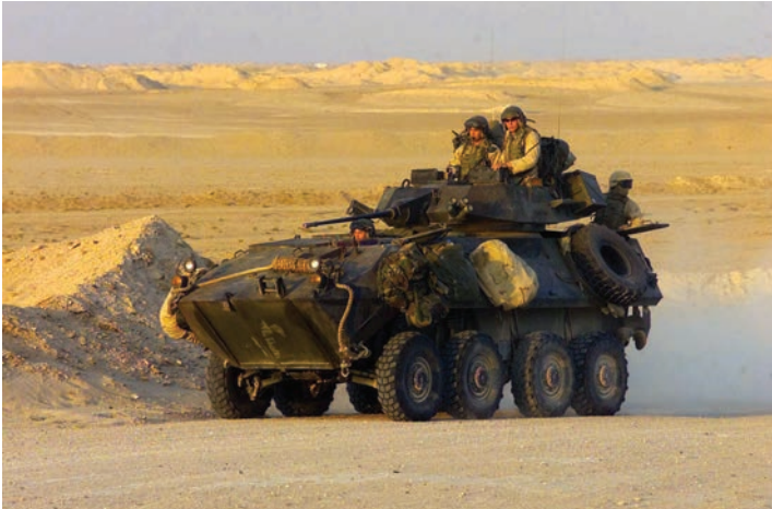
RAND RR309-A.1