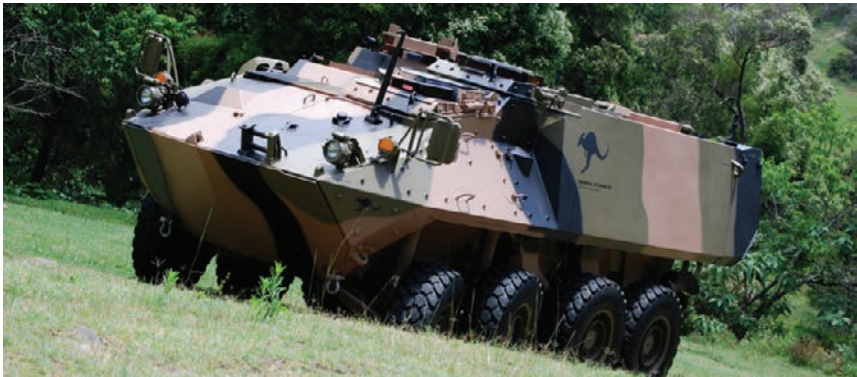
RAND RR309-A.2