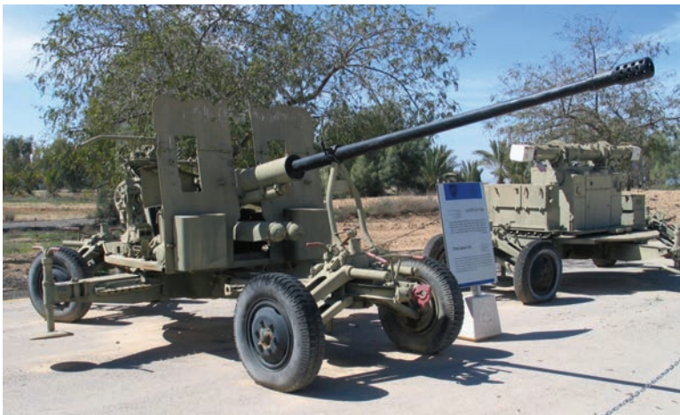
Figure 3.2 S-60 57-mm Anti-Aircraft Gun