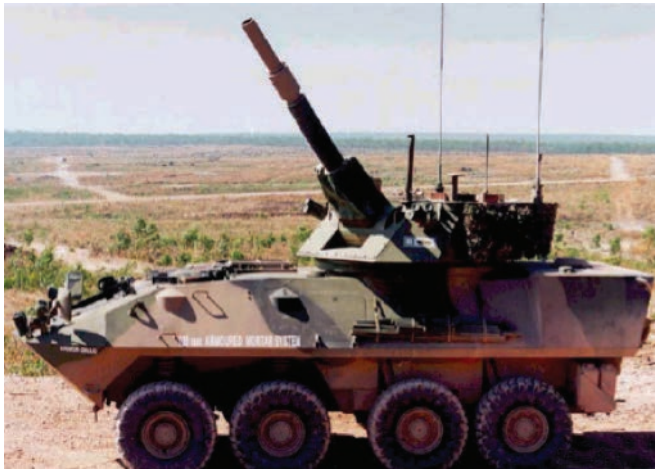
Figure A.5 LAV-M

The original LAV-M procured by the Marine Corps is fitted with an 81-mm mortar system that has a 360-degree traverse and can carry more than 90 rounds. The mortar is mounted in the center of the vehicle and fires through the three-part roof hatch. Newer versions, like the one shown in Figure A.5, included the 120-mm variant, which was purchased by the Saudi Arabian National Guard in 2009. This variant features a 120-mm NEMO (NEw MOrtar) system produced by Finnish Patria Land and Armament. The 120-mm NEMO turret has powered elevation and traverse and can be aimed, loaded, and fired while the crew is completely protected. Maximum range of the 120-mm NEMO mortar depends on the munition fired but is claimed to be around 10,000 m. 6