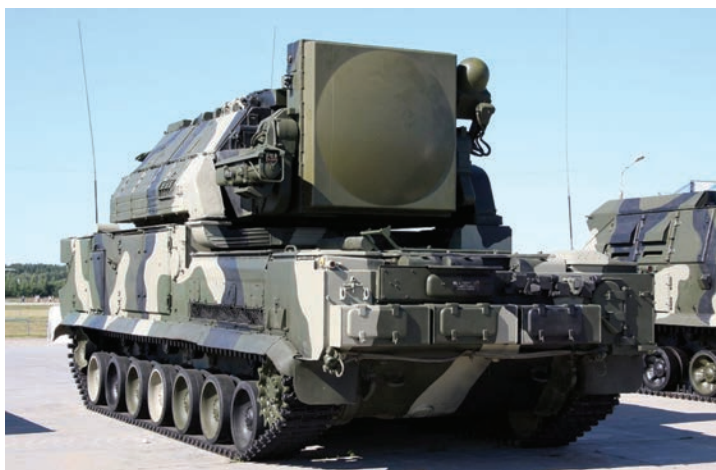
Figure 3.1 SA-15

Other larger, radar-guided SAMs have much longer range. The Russian-produced S-300/400-series (NATO designation SA-10/20/21) SAMs are much larger than the SA-15 and have ranges of up to 400 km, depending on the specific model of missile that is being fired. These large systems operate in multivehicle battery-sized units and require just a few minutes to emplace and prepare to fire, and they have a larger support “tail” than smaller systems, such as the SA-15.