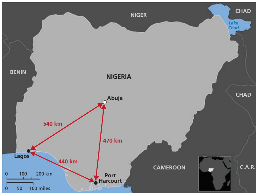
Figure 6.2 Nigeria

In such a scenario, both the strategic and tactical mobility of an airborne light armored infantry force would prove valuable. The