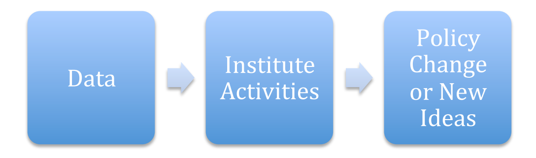
Figure 3.1. A Simple Graphic of the Activist View of Impact

Rather than directly lobbying for campaign finance reform or undertaking major social science studies of the correlations between contributions and politically relevant outcomes, the Institute is a compiler and distributor of information. This suggests a different tack would be needed if we wanted to understand how the Institute really affects the policy space.