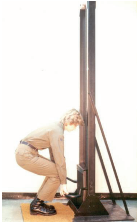
Figure 2.1 The Incremental Lift Machine—Proper Starting Position for Initiating the Lift