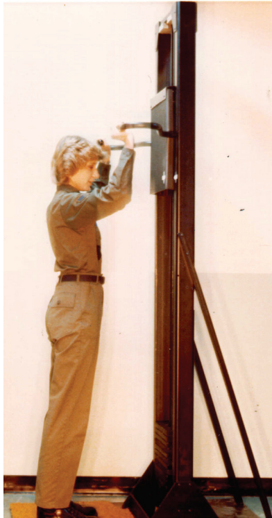
Figure 2.2 The Incremental Lift Machine—Bar Lifted to the Required Height