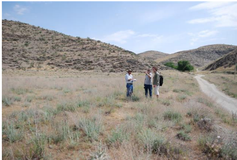
Timirov, Helskog and Jørgensen showing the suggested position of the main parking lot south of the north entrance and west of the road.

If the plans for reception area / visitors' centre in the north are carried out – which is strongly to be hoped for – it follows that a new parking lot must be established. A possible area could be north of group I and west of the road, c. 300 m south of the new possible entrance. An alternative is to have the main parking lot west of the road and to have the possibility of an additional few private cars east of and close to the road. However, it is important not to destroy traces of old cultivation terraces west of the road, and that the east parking is close to the road in order to avoid erosion and landslide towards the river. A simple resting place with benches is possible south of the east side parking.