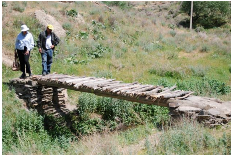
The bridge by group VIII needs some remodelling.