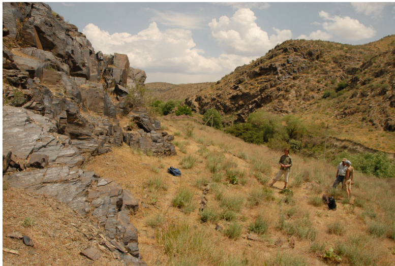
The position of the recommended platform in front of group V.

Because of shortage of time on site, it was not possible to go through the southernmost part of the visitors' route in such detail. It is, however, recommended to follow the previous plans for this part.