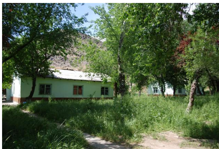
Buildings at the north camp.

The collection of houses by the north entrance to Sarmishsai Gorge was built in 1964 for researchers and workers connected to the geological company searching for gold in the area. In 1967 the area was passed on to Bukhara Geological-Technical Collegen then renamed and passed on to the Economic-Financial College in Bukhara. In 2002 the geological project in Sarmishsai was closed when NMMC decided to do no more research or exploitation of minerals in the area. Today, even though the area belongs to Sarmishsai Reserve-Museum according to the Kadaster, it now partly functions as a temporary summer field station for college students and partly as camp ground for paying visitors. These uses cause major problems in Sarmishsai.