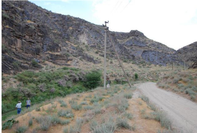
The new bridge between group VII and group IX should not start further north than minimum 14 m south of the electricity pole in the middle of the picture.