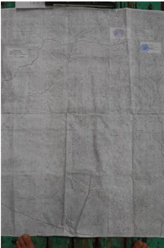
The signed and stamped Sarmishsai Kadaster map, showing the borders of the protected area (cf. chapter 2.7).