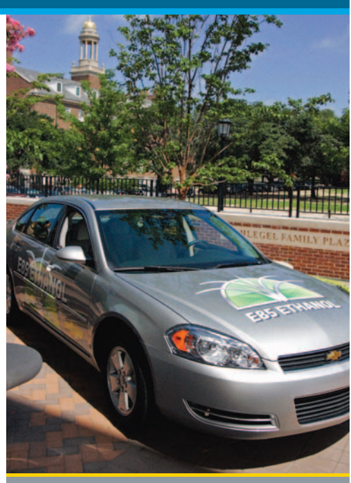
Flexible fuel vehicles can be fueled with unleaded gasoline, E85, or any combination