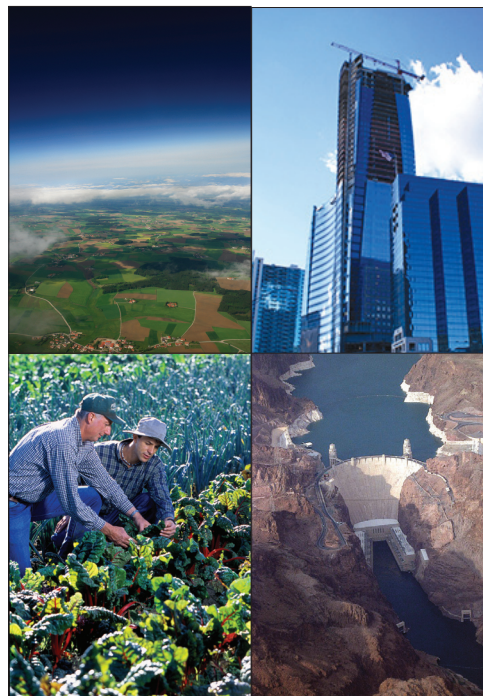
Figure 1. The users of climate data are diverse, including city planners, energy producers, and farmers.

However, as the effects of climate change become more apparent—with potential impacts including sea-level rise, an ice-free Arctic in some seasons, and large scale ecosystem changes—past conditions will no longer serve as reliable predictors of future climate events. Climate change could increase the