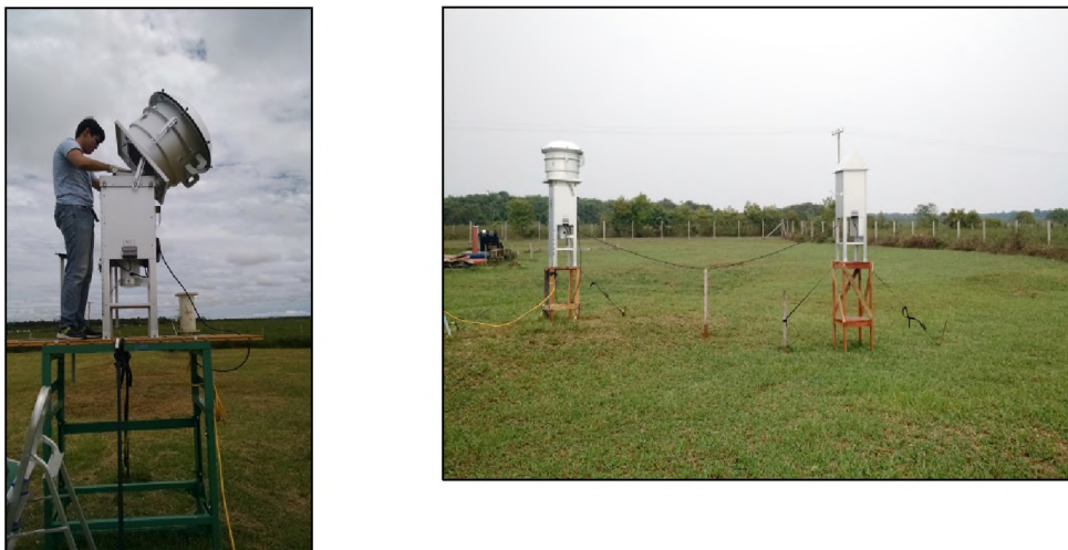
Figure 1: High-volume samplers ( \text{PM}_{2.5} and TSP) at the ARM site in Manacapuru, Amazonas.

In this work, the \text{PM}_{2.5} levels were obtained from March to December of 2015, totaling 34 samples and TSP levels from October to December of 2015, totaling 17 samples. Sampling was conducted with \text{PM}_{2.5} and TSP high-volume samplers using quartz filters (Figure 1). Filters were stored during 24 hours in a room with temperature (21,1°C) and humidity (44,3 %) control, in order to do gravimetric analyses by weighing before and after sampling. This procedure followed the recommendations of the Brazilian Association for Technical Standards local norm (NBR 9547:1997). Mass concentrations of particulate matter were obtained from the ratio between the weighted sample and the volume of air collected. Defining a relationship between particulate matter ( \text{PM}_{2.5} and TSP) and respiratory diseases of the local population is an important goal of this project, since no information exists on that topic.