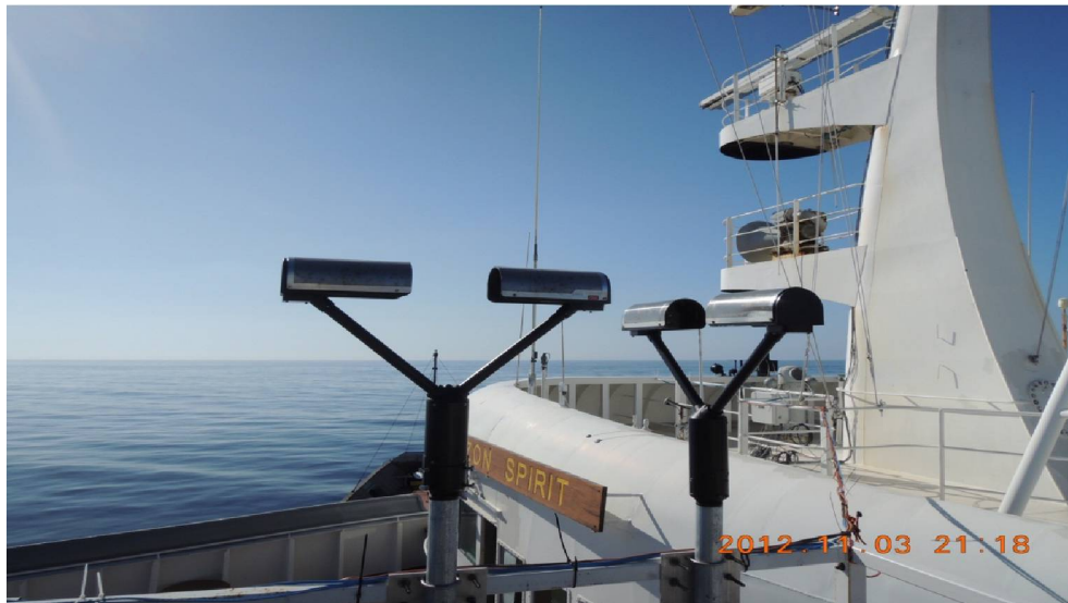
Figure 1. The two Parsivel disdrometers on the Horizon Spirit set perpendicular to each other to mitigate the impact of wind direction on the measurements of rainfall and raindrop particle size distribution.

As part of the Parsivel Disdrometer Support for MAGIC intensive operational period (IOP), a pair of Parsivel optical disdrometers were deployed on the ship during MAGIC (Fig. 1). The deployment of the optical disdrometers were to ensure the collection of reliable measurements of rainfall rate and raindrop particle distribution. In addition, the Parsivel measurements were to provide constraints on the calibration of the radars on the ship during MAGIC.