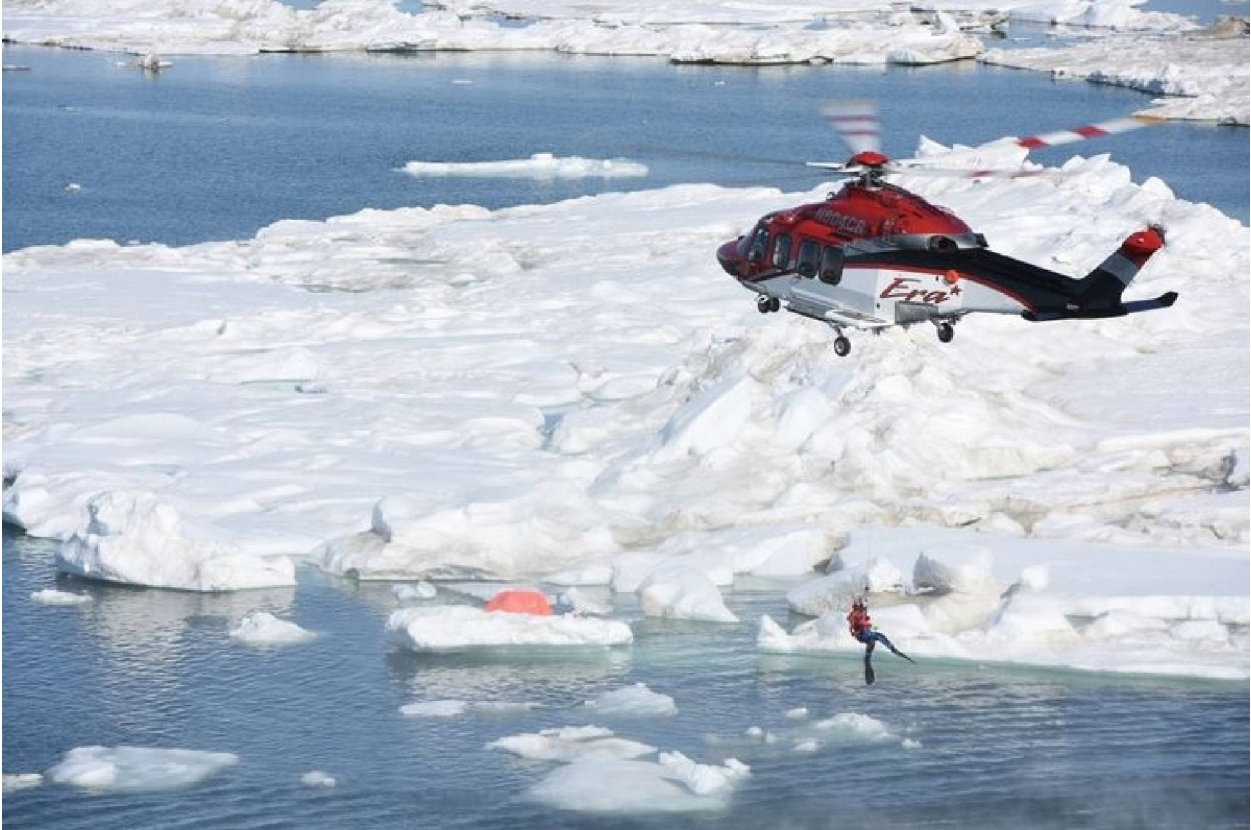
Figure 1. A helicopter crew lowers a rescue swimmer into the Arctic Ocean in DOE airspace near Oliktok Point, Alaska during the Arctic Shield exercise in July, 2015.

Collaboration and safety, as well as research applications, were also priorities for ARM researchers during the exercise. In 2004, ARM was granted a four-mile-diameter restricted area around Oliktok Point, its base of operations for Arctic atmospheric measurements. Restricted areas are for U.S. airspace and warning areas apply to international airspace. The restricted areas was renewed in 2010, but the ARM facility saw the potential for more extensive, ongoing experiments, which created renewed interest in operating offshore. It was clear that balloons with sensors tethered in low clouds could pose dangers to aircraft, especially the small private planes that operated throughout Alaska.