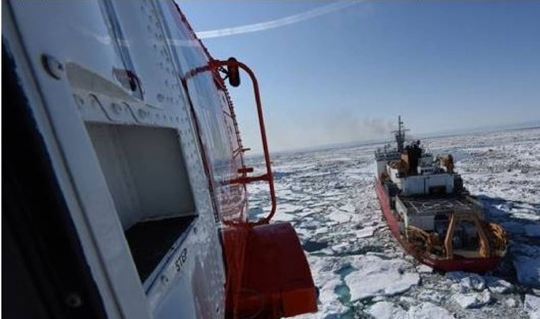
Figure 4. A helicopter prepares to land on the Healy after a rescue trial.

The link below provides a short video by Brian O’Kronley of the ScanEagle UAS in use at Oliktok Point, including both launch and retrieval.