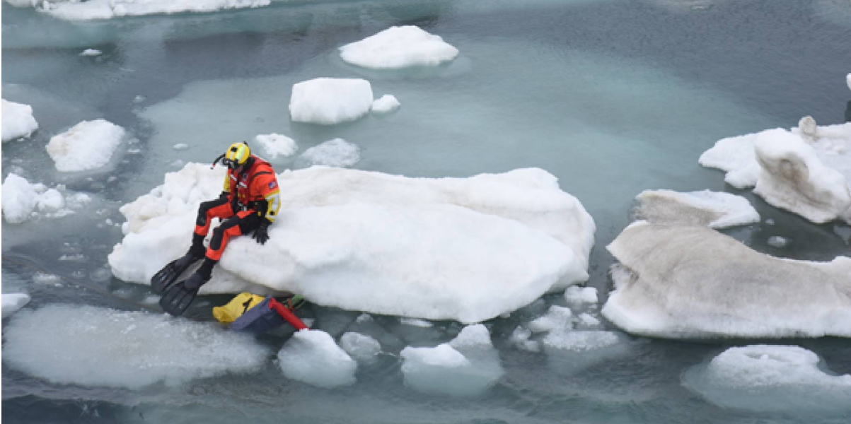
Figure 2. A USCG aviation survival technician approaching the simulated person used in the Arctic Shield exercise in July, 2015.