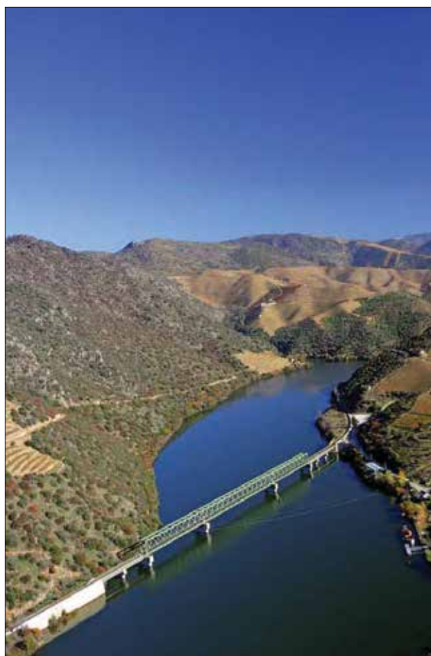
Rio Duoro Ponte Ferradosa, Portugal

In the case studies, the actions that appear to have been most successful in engaging members of the public have been at local scale, as in Venice and the local forums organised in Hungary's Tisza River basin. These results suggest that while members of the public can provide information about broad values and concerns relating to water management (of the kind collected by the Rhône Méditerranée survey), their knowledge about and interest in water management issues tend to be focused locally. Stakeholder groups with strong community-level connection, such as environmental NGOs and