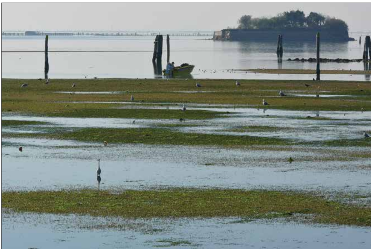
Landscape in the Venice Lagoon, Italy © Venice City Council. Photography competition: The seasons of the Lagoon — landscape, flora and fauna ( Le stagioni della Laguna — paesaggio, flora e fauna ), 2007

seeks to represent a geographical balance across the EU, examples at a range of administrative levels (from local RBD level), cases involving engagement with the general public as well as engagement with stakeholders, and a wide variety of issues and pressures, including water availability, flooding, diffuse pollution and biodiversity. Some case studies involve the preparation of RBMPs; others look at quite different water management issues.