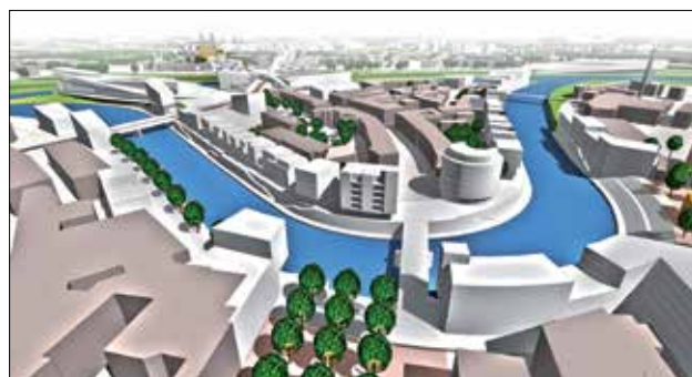
Pilot project Chwaliszewo, Poland

Another interesting and effective approach to providing information for the general public rather than for expert stakeholders or technical specialists exclusively was the use of maps in the development of the VTT plan in Hungary. The aim was to encourage discussion about dam locations and compulsory farmland purchases. Here, it is important to note that modified maps were produced to reflect the comments and suggestions put forward in public meetings; as a result, the maps