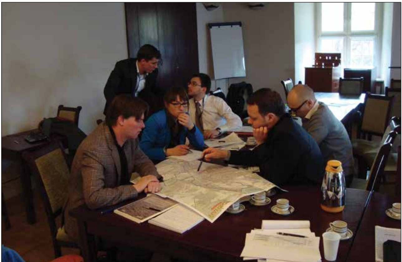
Project meeting for the Poznań case study, Poland

The consensus-based approach has been supported by the Hydrological Confederation of the Ebro (Confederación Hidrográfica del Ebro (CHE)). From 2006, CHE developed the River Basin Plan for the Ebro RBD (Plan Hidrológico del Ebro) in order to comply with the requirements of the WFD.