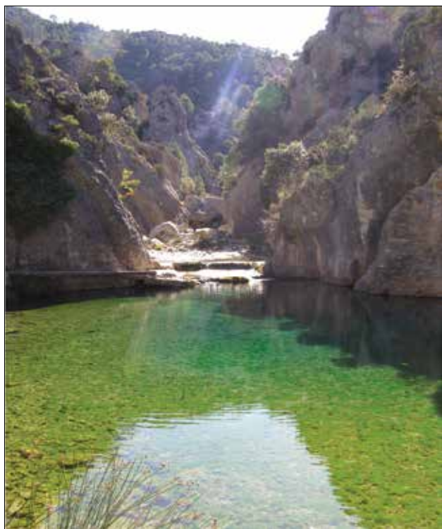
Matarraña River at the Parrizal (upstream stretch), Spain

These examples suggest that while it is important to have formal opportunities for stakeholders and