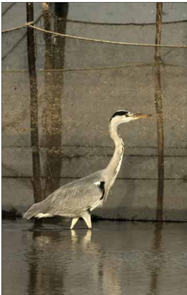
Fauna in the Venice Lagoon, Italy © Venice City Council. Photography competition: The seasons of the Lagoon — landscape, flora and fauna ( Le stagioni della Laguna — paesaggio, flora e fauna ), 2007

protection would restrict their possibilities to engage in these sports. Commercial fishing interests wanted to preserve their livelihoods, which are based on products taken from the environment. Both groups, of course, wished to maintain a lagoon environment that provided these services. Moreover, the park proposal itself — as many types of water and environmental management — could be seen as trying to present a holistic approach that preserves underlying biodiversity and supports recreational uses as well as economic services derived from the environment: indeed, one goal of the park is to attract visitors who support a sustainable form of local economic development. In the Venice case, however, many of these issues are actually addressed not in the park proposal but in other jurisdictions: here, the participatory process for the park appears to have been a lightning rod for conflict, in part due to a lack of participation as yet in other processes, such as Natura 2000 (work on the site management plan, including PP, has been delayed) or water governance under the WFD.