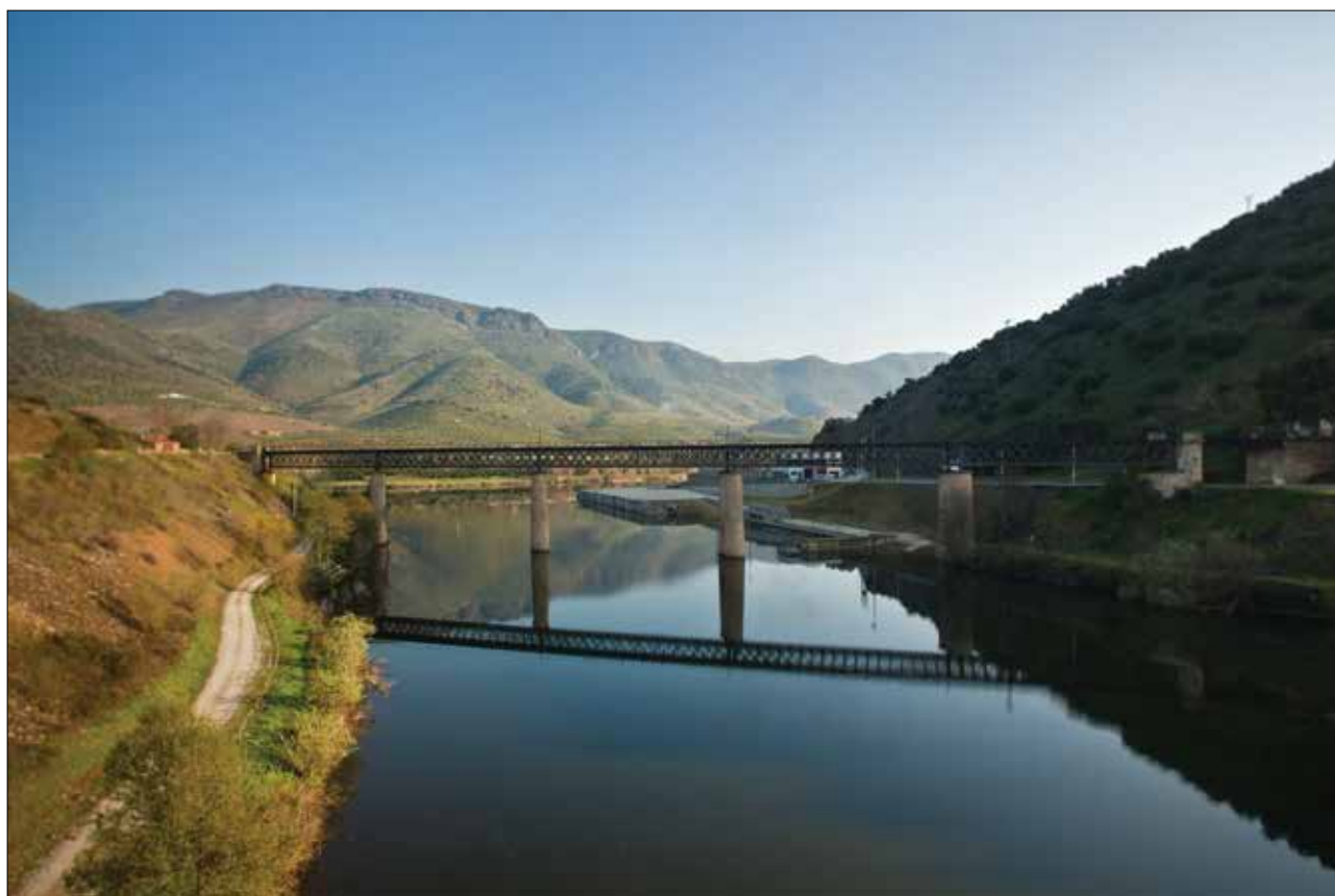
River Duoro Barca d'Alva, Portugal