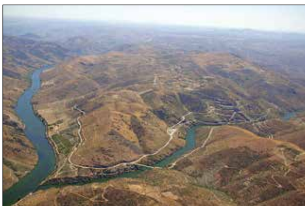
Rio Duoro, Portugal

Of course, being open and transparent has its own challenges: if organisers and participants believe