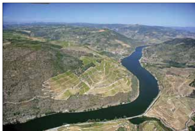
Rio Duoro, Portugal

In northern Portugal, a range of participation activities were organised from 2009 to 2012 for the preparation of this region's three RBMPs (Portugal's first round of RBMPs were prepared late with respect to the EU schedule, which called for completion by December 2009). Throughout the process, a regional water council — comprising