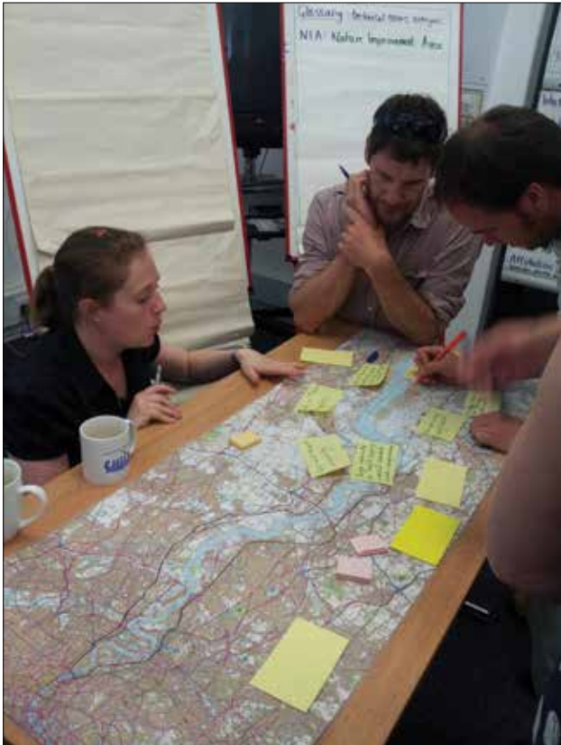
With the Thames Estuary Partnership, the United Kingdom

However, if it is not clear how the interests, concerns and proposals put forward by those involved in PP processes have been used, trust tends to be eroded and stakeholders and members of the public become less willing to participate in the future, and perhaps have less motivation to support implementation of the plan, a potential concern for the Rhône Méditerranée RBMP.