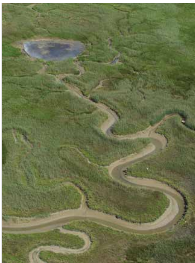
Flora in the Venice Lagoon © Venice City Council. Photography competition: The seasons of the Lagoon — landscape, flora and fauna ( Le stagioni della Laguna — paesaggio, flora e fauna ), 2007

technical staff who had developed proposals for the plan with local communities and the farmers in the Tisza encouraged more open discussions about the options. This is not to say that face-to-face engagement is always better than other methods such as online participation, but that it must be included in the mix of tools.