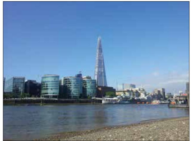
Thames, the United Kingdom

These summaries highlight how case studies differ across several dimensions. In terms of scale, three case studies are at local scale — those in Italy, Poland and the United Kingdom — while other case