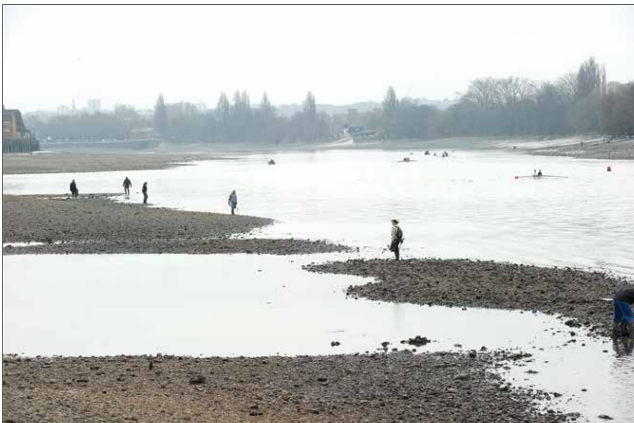
Upper Thames, the United Kingdom

and analyse the use of water information systems, more distributed data approaches and possibly the structured implementation and information framework (SIIF) approach proposed by the Commission.