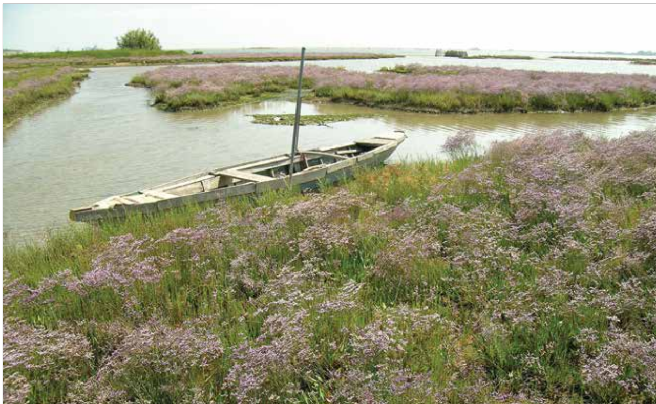
Flora in the Venice Lagoon Photography competition: The seasons of the Lagoon — landscape, flora and fauna ( Le stagioni della Laguna — paesaggio, flora e fauna ), 2007