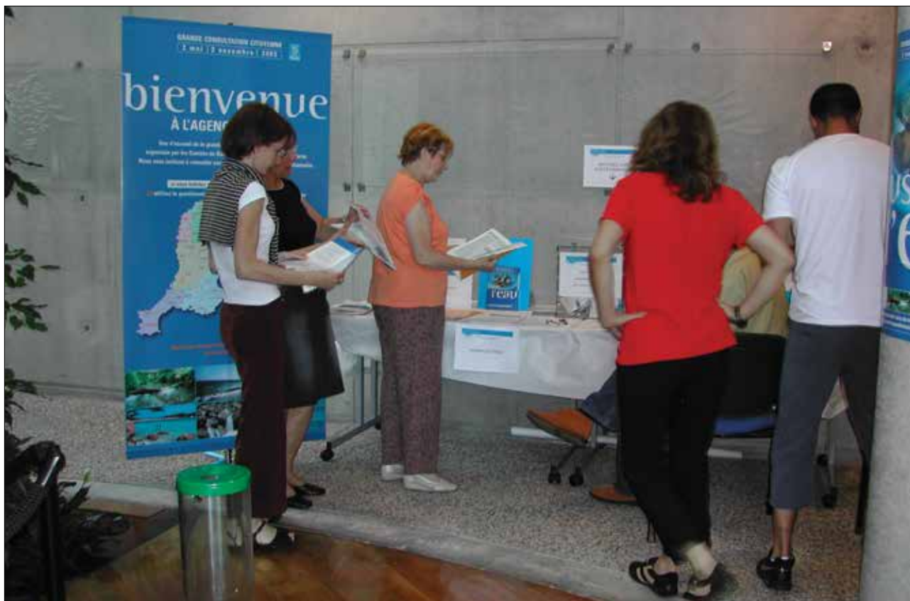
Involving the public in the Rhône Méditerranée Basin, France

In reaction, however, to concerns over the high costs and limited value, a different survey approach was followed in the Rhône Méditerranée for the second RBMP: an online questionnaire with open questions was used in 2012, to provide qualitative as well as quantitative information. Responses thus provided more information, and costs were reduced. However, the response rate was much lower due