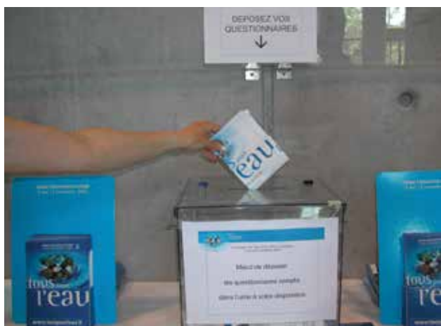
Survey for the Rhône Méditerranée basin, France

were a tool both for the technical experts and for the participants, who could all see their proposals clearly set out.