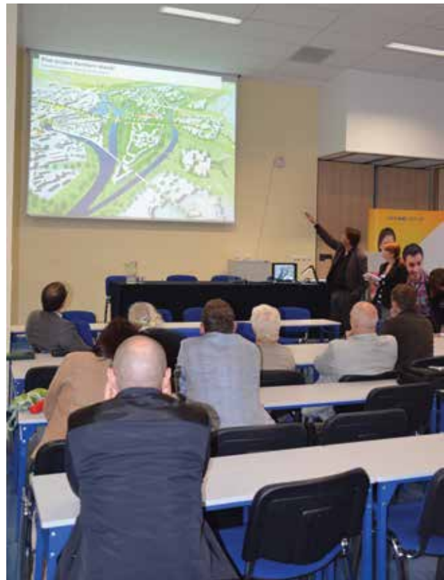
Public consultation meeting for the Poznań area, Poland

and trustworthiness of government may be compromised (Rees et al., 2005). If PP is well organised, it will ensure ownership and public acceptance of the decision, resulting in fewer conflicts, fewer delays and better implementation.