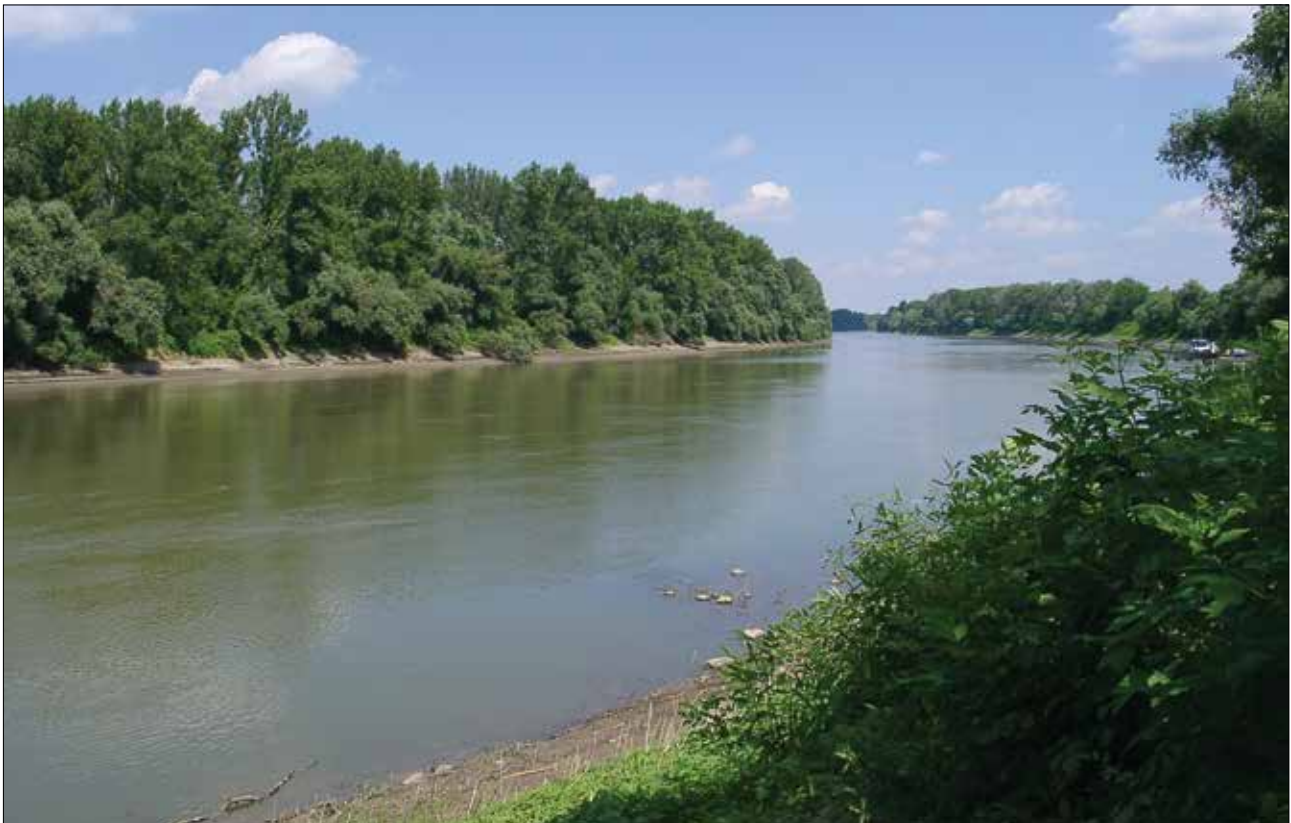
Tisza River at Vezseny, Hungary

In the other case studies, it does not appear that fixed time-frames were set in legislation. In Hungary, the participation process appears to have delayed the approval of the plan. Here, the original plans for PP were inadequate and the process expanded. At the same time, the organisers were able to accommodate the broadened process and use it to make decisions relatively quickly —