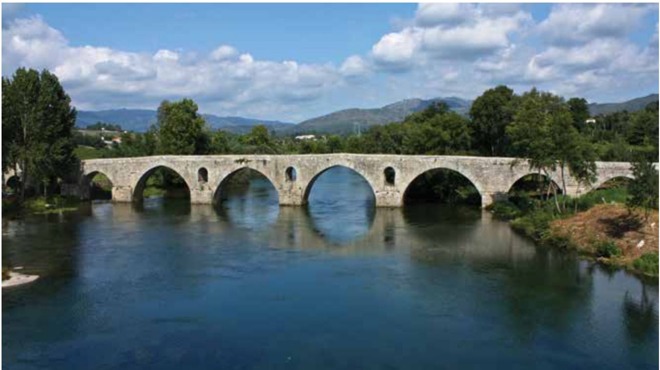
Rio Cvado, Portugal

In this context of transparency, corruption is a failure in governance that can be defined as 'the abuse of entrusted power for personal gain' (Plummer, 2008). It can occur amongst public officials, between public officials and private actors, and between public officials and users/citizens (Plummer, 2008). This definition suggests a close relation to a lack of transparency that can assume many forms and occur at practically any administrative level. While it is clear that the absence of transparency behind corruption is the antithesis of the principle behind PP, it must be noted that participating actors (administrative bodies, stakeholders and the broad public) are all