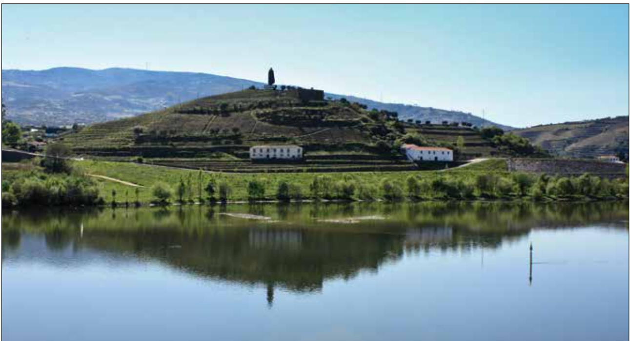
Rio Duoro — Peso da Agua, Portugal