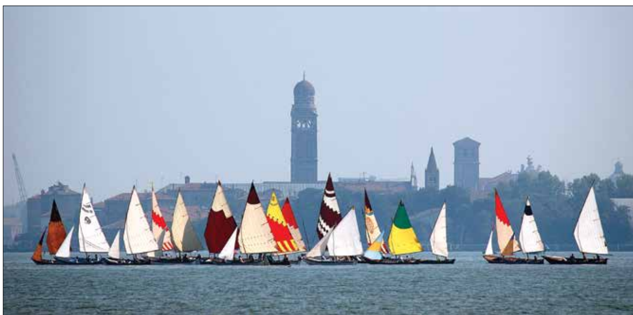
Landscape in the Venice Lagoon Photography competition: The seasons of the Lagoon — landscape, flora and fauna ( Le stagioni della Laguna — paesaggio, flora e fauna ), 2007

While permanent stakeholder bodies play a key role in participation in several RBMP case studies, the river basin committee for the Rhône Méditerranée