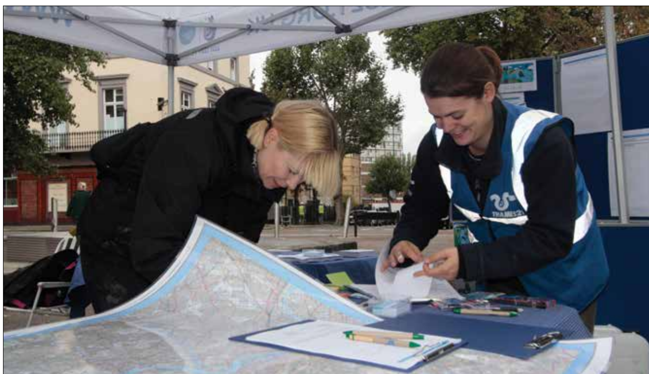
Pop-up Workshop Thames 21, the United Kingdom