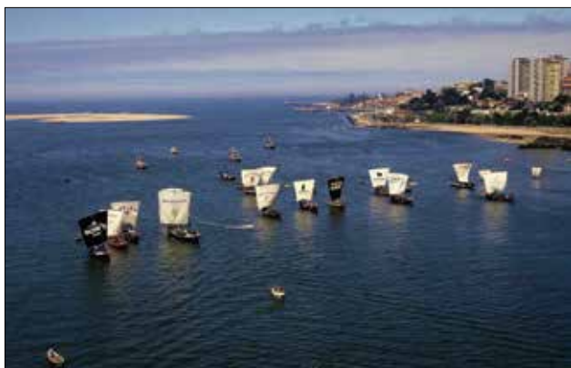
Rio Douro, Portugal

This issue is of particular interest at the moment, as EU institutions are increasingly promoting the principle of the Shared Environmental Information System (SEIS), in which the access to and use of environmental information is open and transparent: from the information source through to the different levels where it is used. With the Structured Information and Implementation Framework (SIIF), the Commission (EC, 2012b) introduced a way forward for better