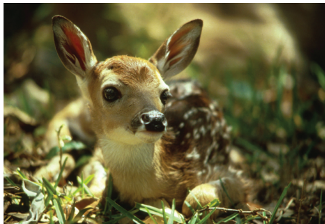
White-tailed deer fawn