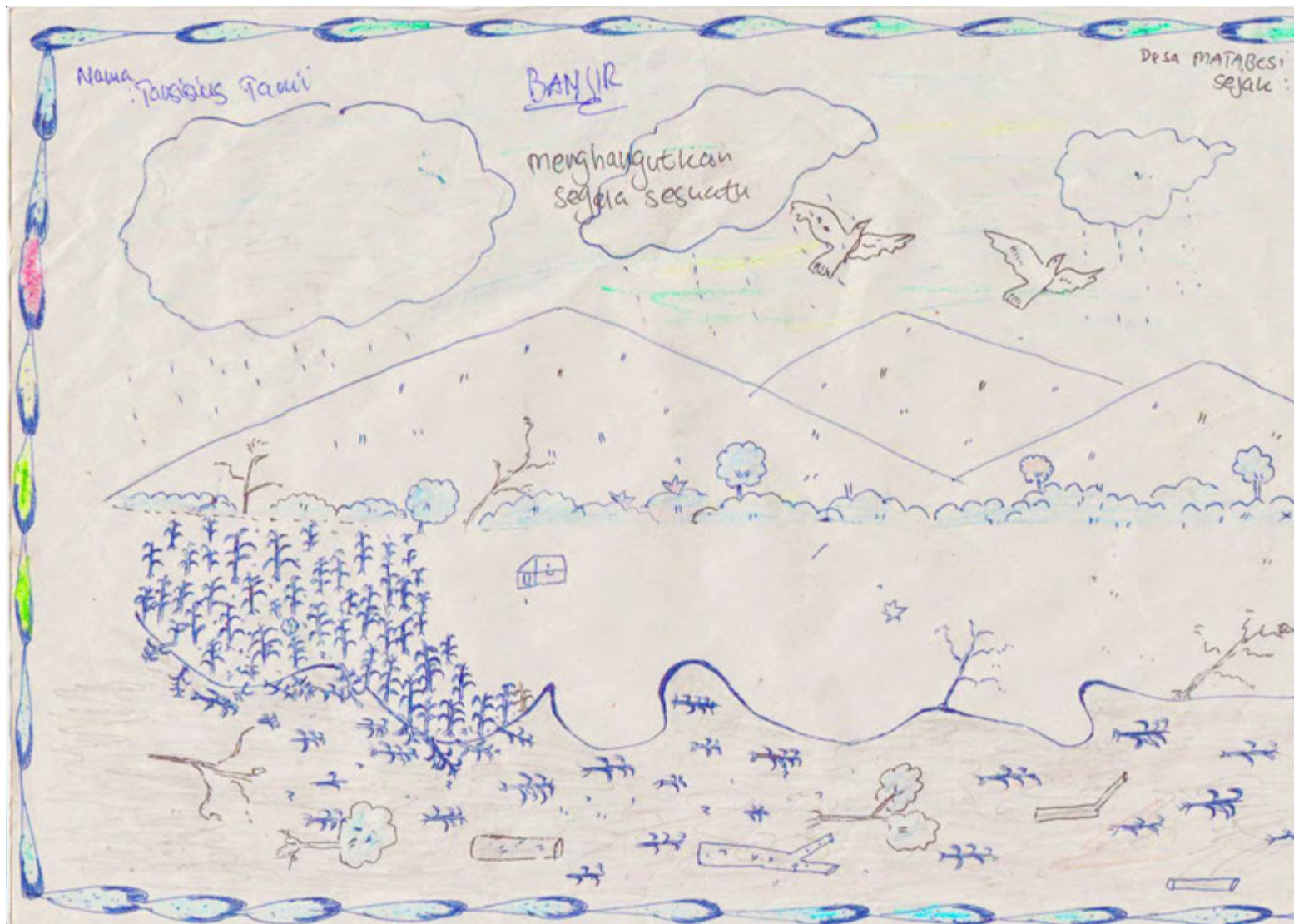
Drawing by Tarsisius, Indonesia