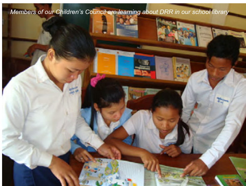
Members of our Children's Council are learning about DRR in our school library

Under the Child Centered Disaster Risk Reduction (CCDRR) project implemented by Plan Cambodia since 2009, the Children's council's members received related training and documents, such as manuals on disaster risk reduction and on climate change adaptation.