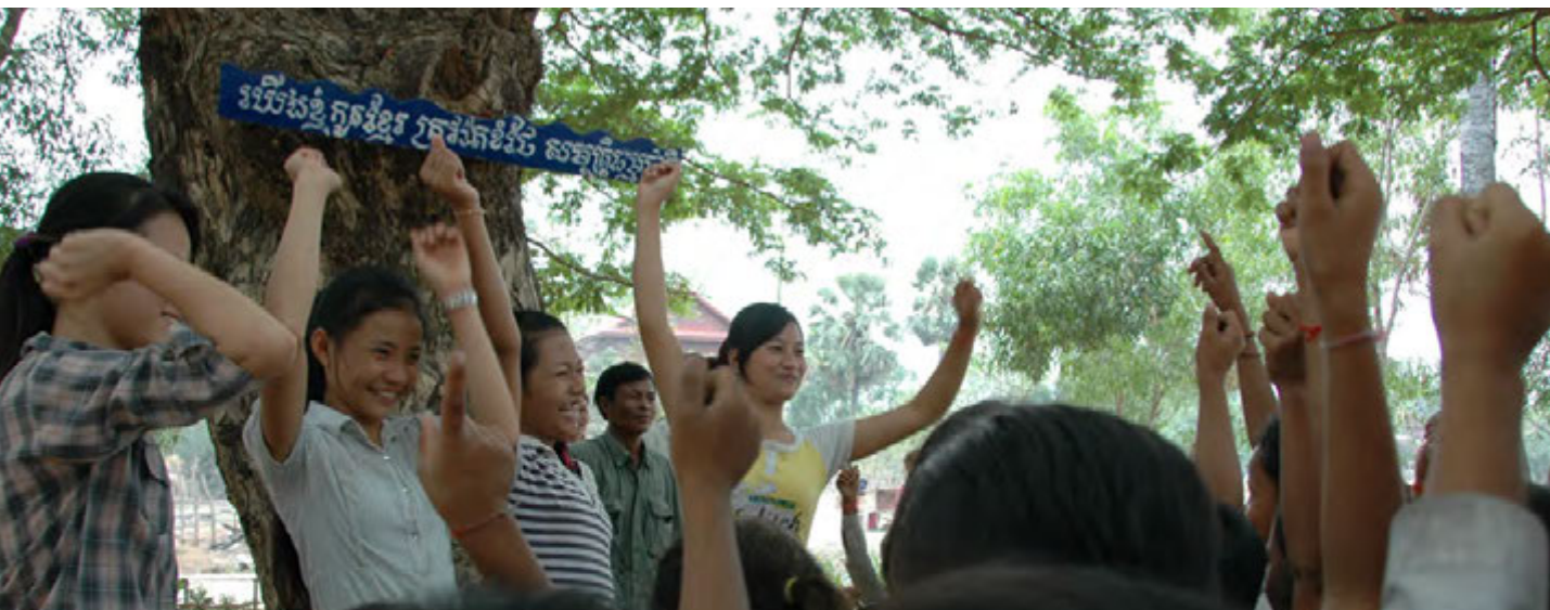
Youth-led campaign to prevent climate change in Angkor Chum district, Cambodia

The Asia Ministerial Conference on Disaster Risk Reduction (AMCDRR) Declaration adopted in Incheon in 2010 recognized “the need to protect women, children and other vulnerable groups from the disproportionate impacts of disaster and to empower them to promote resiliency within their communities and workplaces.” (1) Specifically it called on DRR stakeholders to promote child-and-people-centered education for community preparedness and risk reduction.