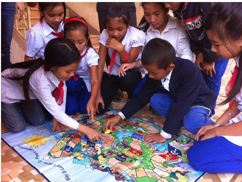
Learning through play with the Riskland game

We will continue to organize awareness events at our schools to provide knowledge to the newcomers in the new school year. Of course, we children will teach other children as it is easier to understand and share ideas. We would also like to have more dialogue between children and teachers and adults. For example, our video was a good way for us to share our views with the community and the local officials. We are excited that with a part of the seed fund, we can start lots of activities like planting trees for prevention of landslide and protection of water sources. In order to have a better environment for learning and playing at school, we will use our seed fund to set up the rain water storage system in our school. We hope that by seeing that example, adults can do the same at their homes so that girls do not have to travel to the river to fetch water.