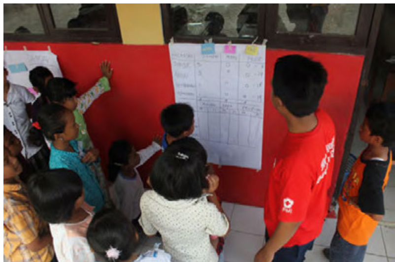
Pupils in our primary school, participate actively in hazard analysis

My village is also vulnerable to whirlwind. Usually when it happens, most people do not know what to do except to panic and run to an empty ground. Whirlwind will cause damages to a number of