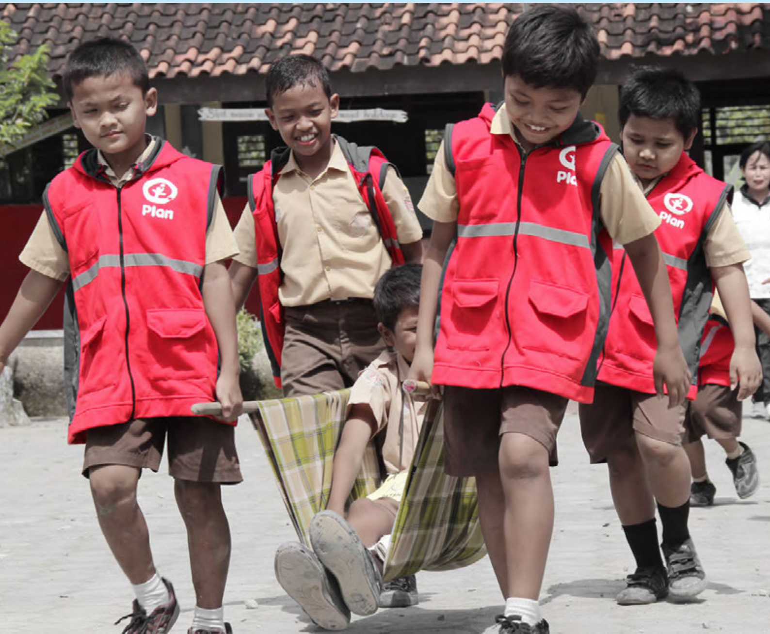
In Action: Disaster Preparedness Team conducting a mock drill in their Primary School in the Indonesia