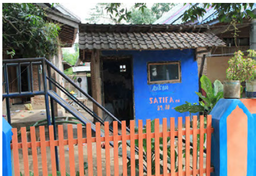
The community radio SATIFA FM in the village

The children also realized that in order to have the possibility to voice their own concerns, they have to initiate it by themselves to gain support from the adults. Therefore we agreed and decided to become involved in Sanggar Sinar Pajo (Children's workshop) and proactively plan useful activities on DRR. We learn about practical examples on prevention and mitigation toward disaster risk. We also researched by ourselves by accessing newspapers, online media and by learning from study visits. We also asked Plan's staff to share with us any useful Information material and publications on DRR.