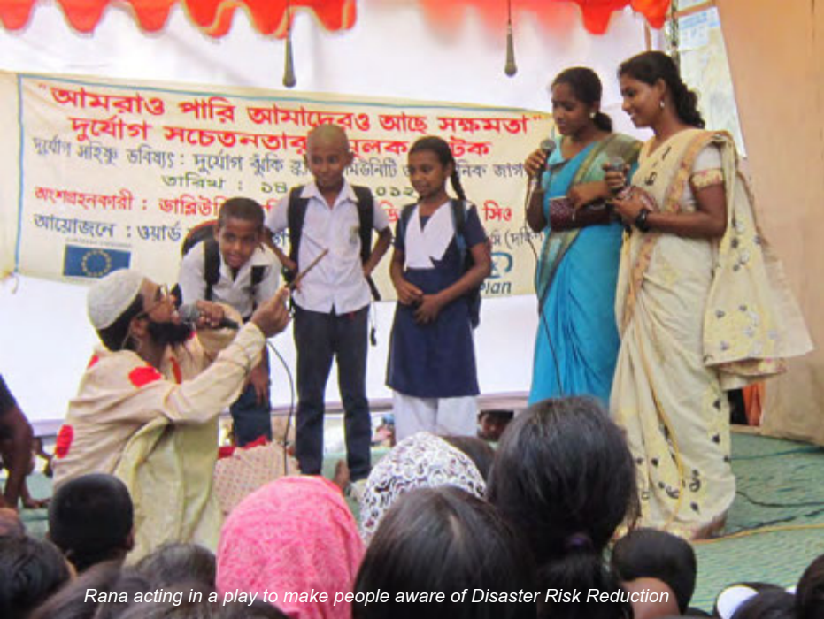
Rana acting in a play to make people aware of Disaster Risk Reduction