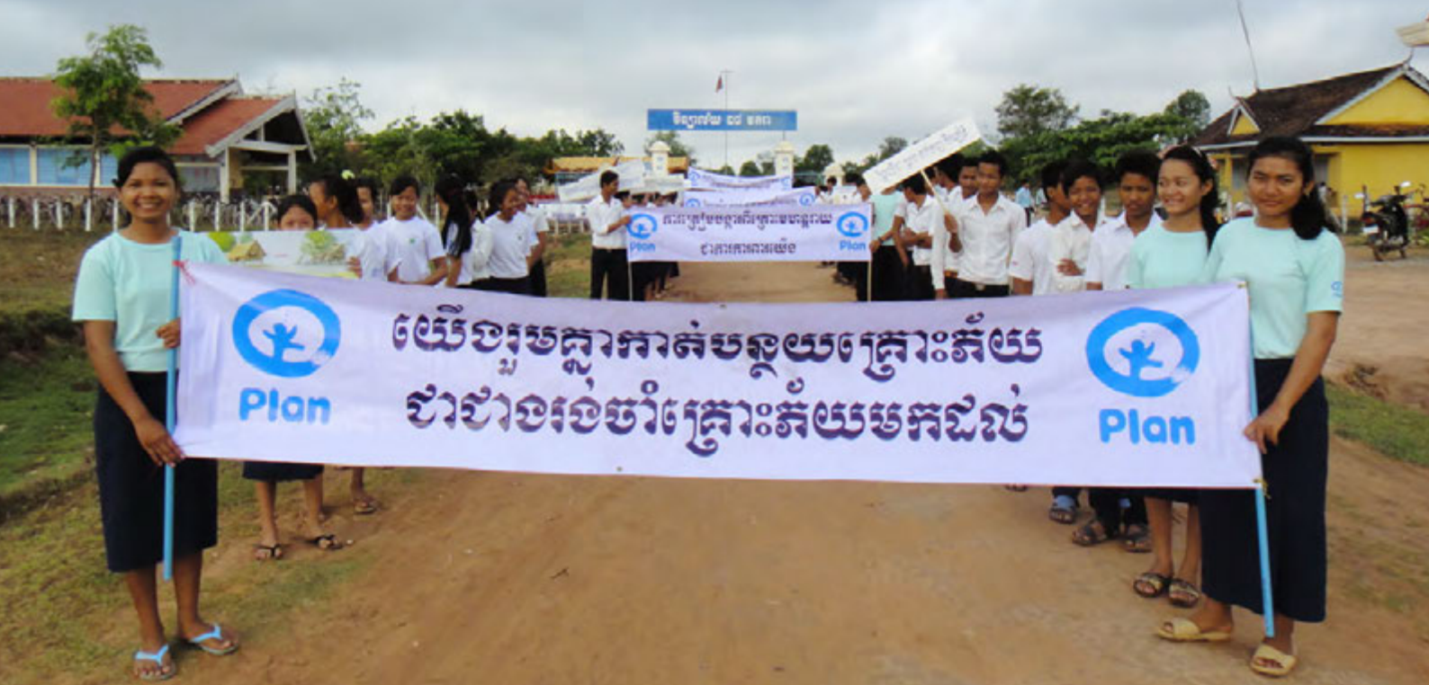
Children council in 28 Makara school, Cambodia organize a campaign on DRR