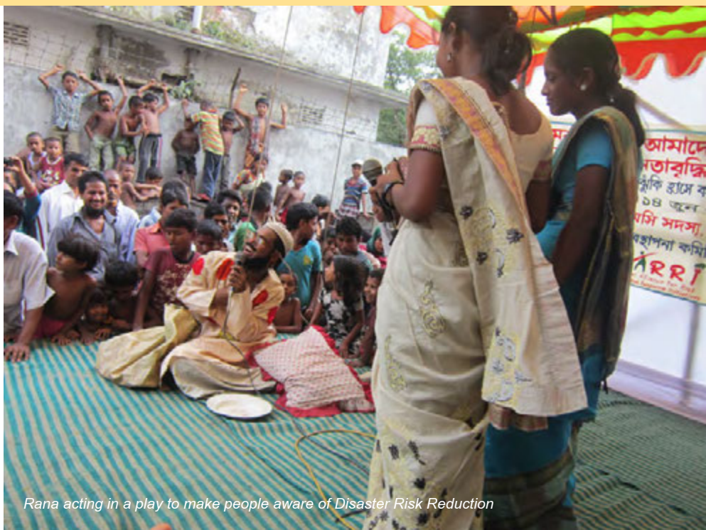
Rana acting in a play to make people aware of Disaster Risk Reduction

Most of the houses of my living area are tin shed buildings. Four or maybe five houses are semi paka . (14) The roads are narrow and fragile. The drainage system is not good. All the time, most of the drainage line is filled with waste and garbage. Here in our community there are five water tube wells which is very limited for the size of its population. Among the five wells, two are also damaged. In terms of occupation of the 200 households surrounding my living area, 98% of the people are cleaners who working at the City Corporation, the remaining 2% are rickshaw pullers.