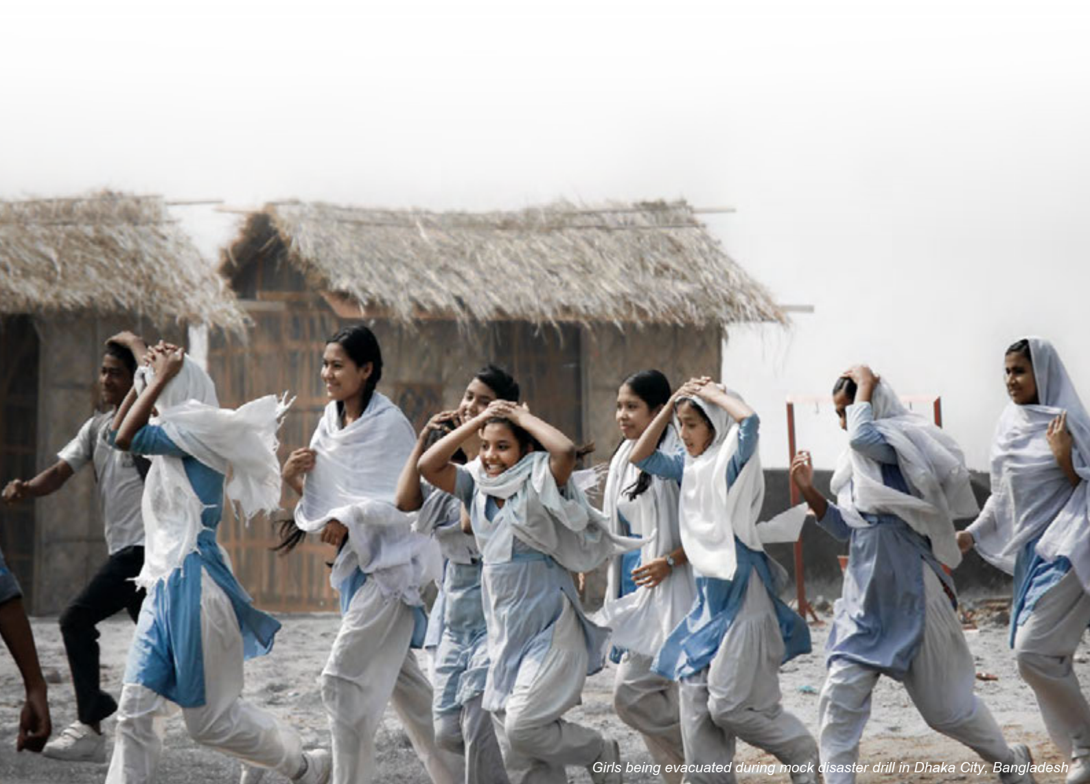
Girls being evacuated during mock disaster drill in Dhaka City, Bangladesh