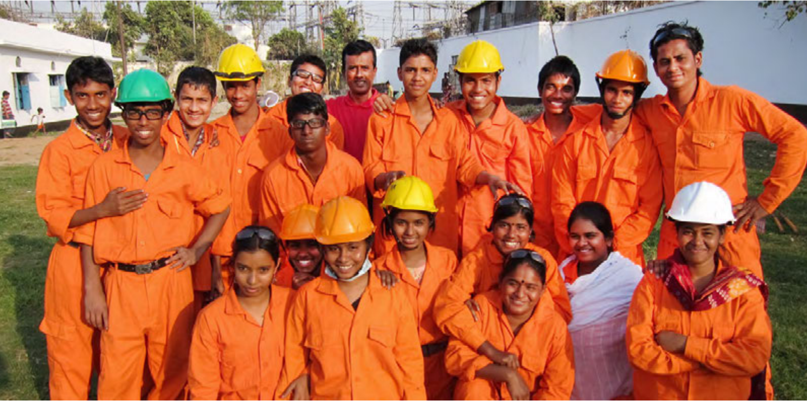
Me and the other Slum Volunteers

For example we can form more children's organizations, initiate a community based approach to disaster risk reduction and advocate for a community based disaster fund.