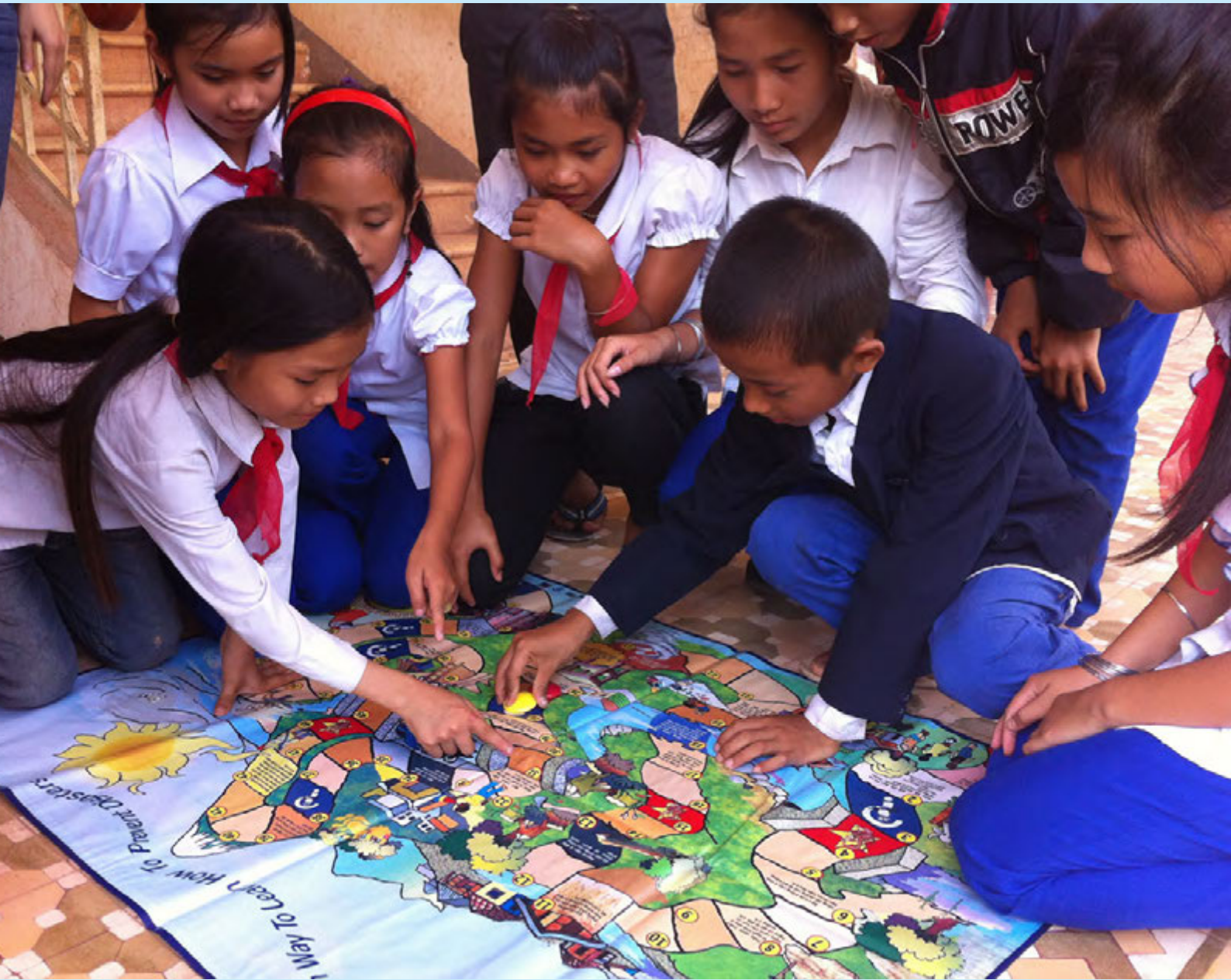
Learning through play with the Riskland game in Viet Nam