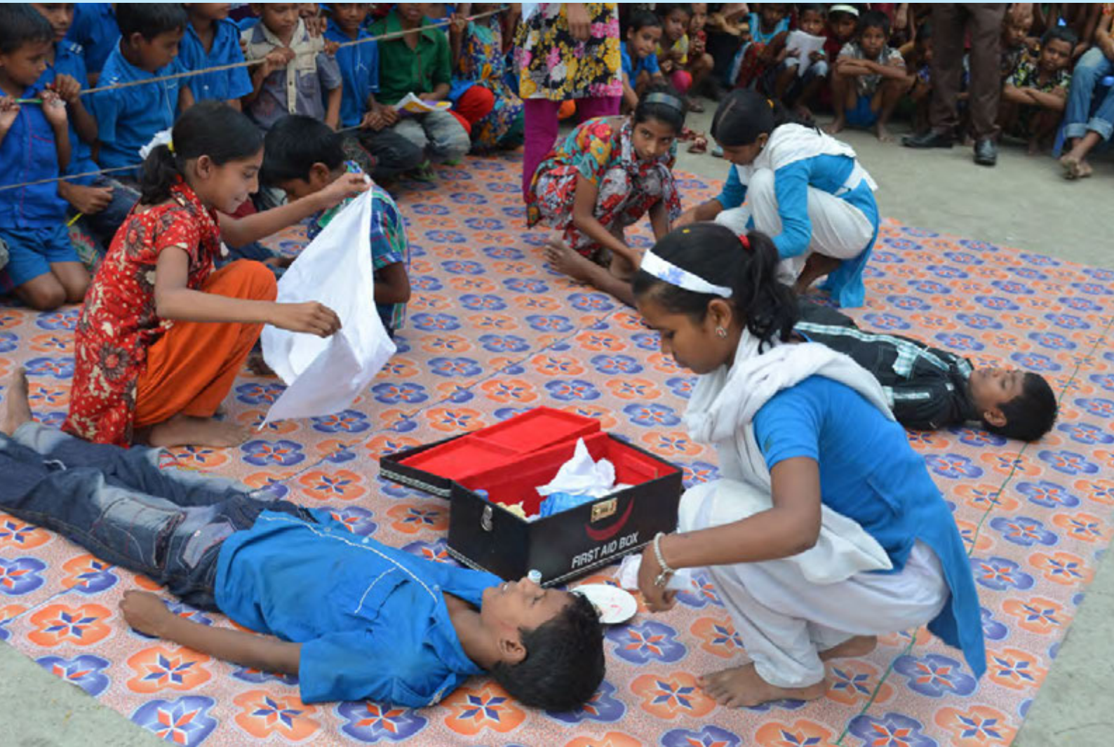
Children learn first aid during mock drill at school in Bangladesh