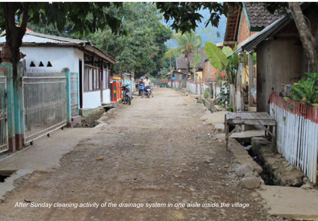
After Sunday cleaning activity of the drainage system in one aisle inside the village

We also remind the community about the experience of a past flood incident in their village, which caused a crop failure and affected the income and livelihood of the community. Regarding the environment and hygiene issue, we spread messages and raise the awareness in the community about “the importance of hand washing” before and after having meals and after defecating; not performing open defecation (ODF); consume clean water (boiled water) to prevent the infection of any disease, especially during floods.