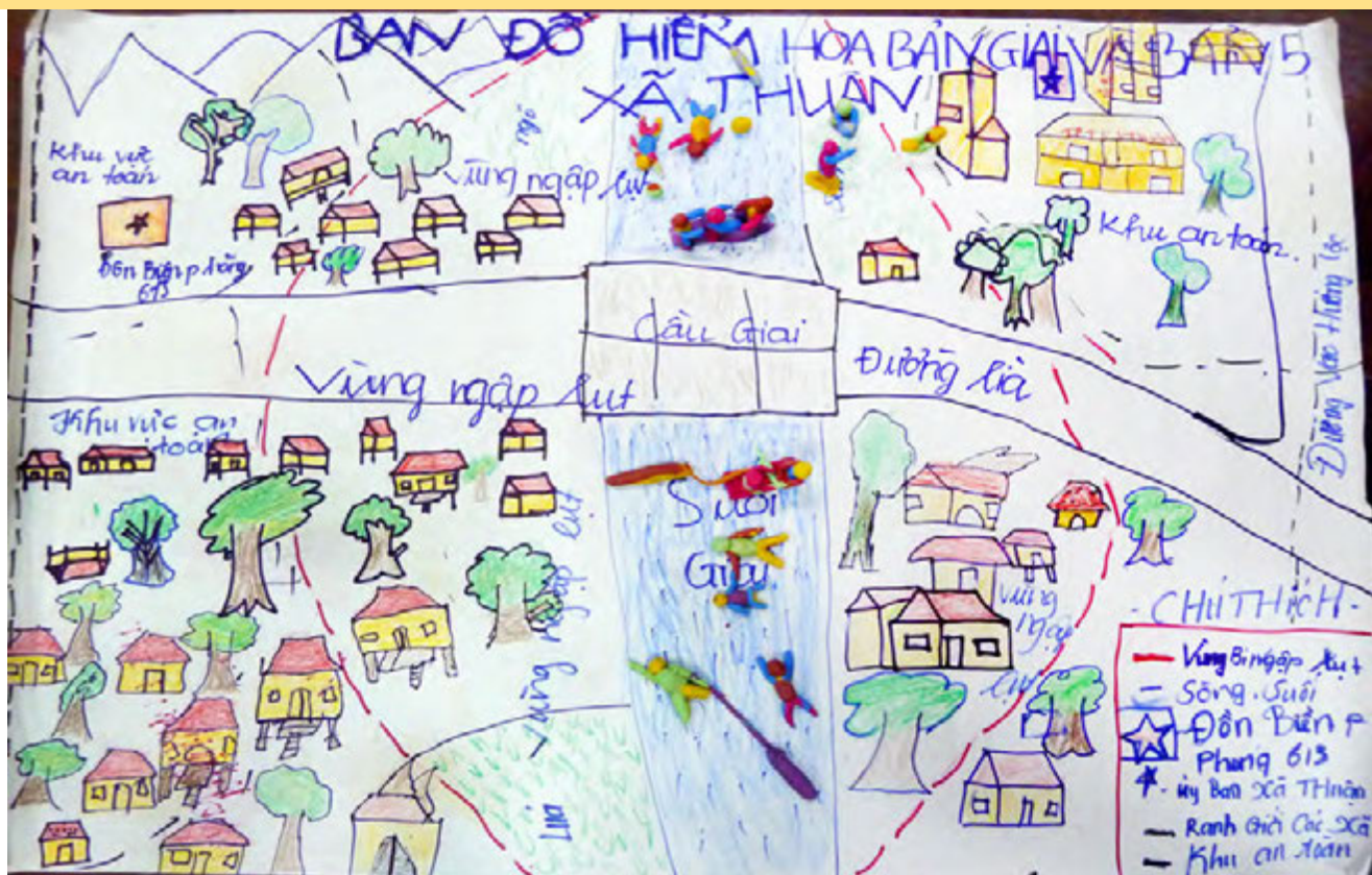
A map of hazards, vulnerabilities and capacities in our village

We are the DRR Communication and Facilitator Youth Group in Huong Hoa district, a mountainous area of Quảng Trị, Viet Nam.