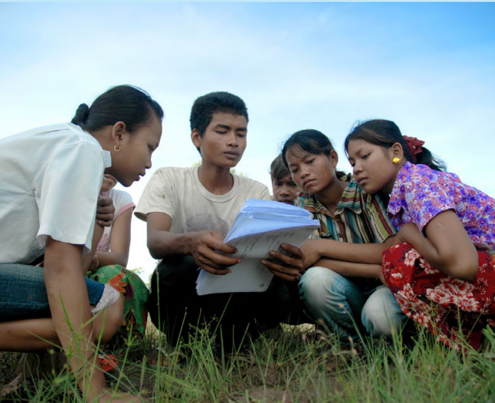
The youths who drafted the Disaster Risk Reduction (DRR) Action plan for their village in Cambodia