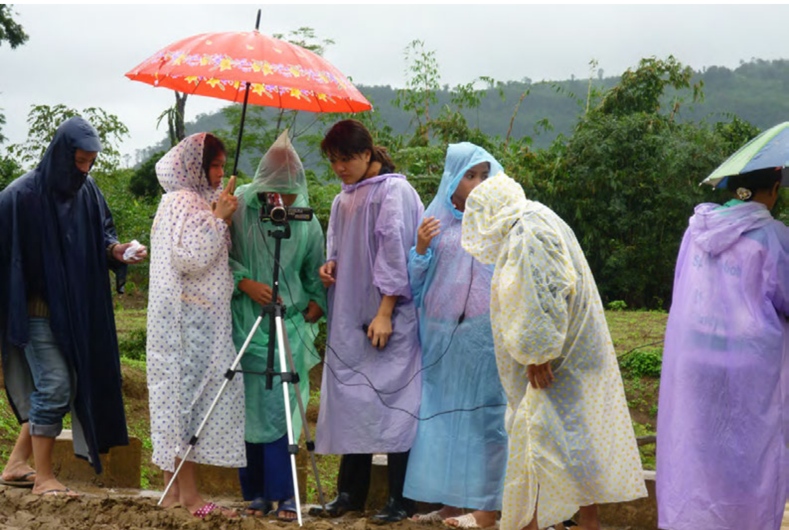
And Action! We are making a movie about disaster risk reduction in our village

For the first time, we got to know that we can learn from interesting games such as the Riskland game, and the drawing and modelling exercise. It not only helped us understand more, but also gave us a chance to feel more confident to talk with adults and their friends about disaster and climate change risks and measures to cope with its impact. We also could show our drawings and photos to the local government during the DRR Day to express our needs and concerns.