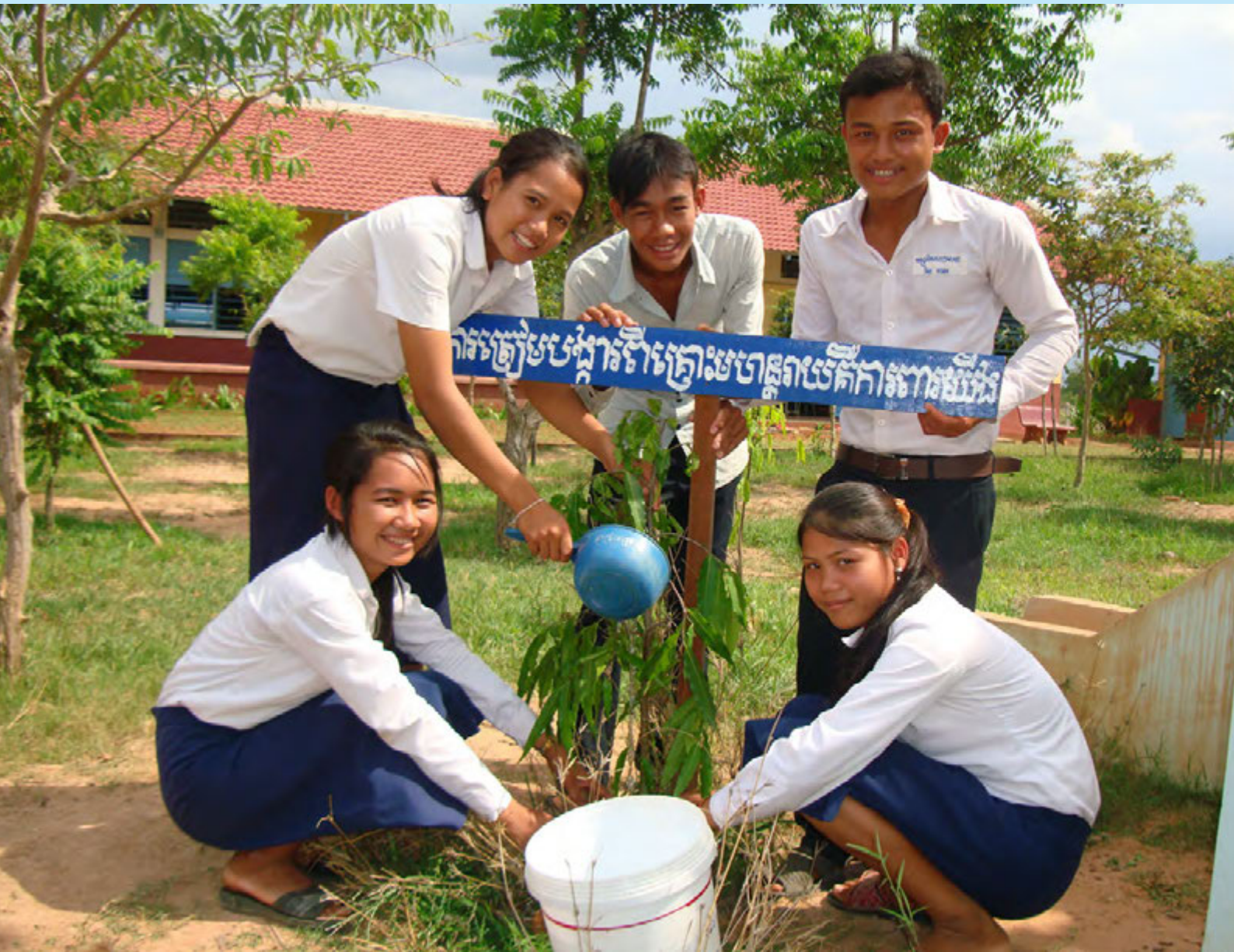
Disaster preparedness is protecting us: Children council in 28 Makara High School, Cambodia