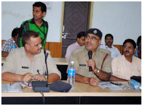
District-level workshop organised in Patna district under the Gol-UNDP DRR Programme for developing the DDMP.